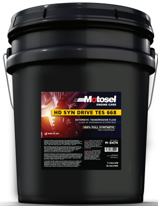
#M-0474 / 5 Gallon