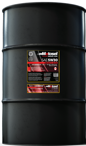
#M-1046 / 55Gal